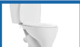
Glazed ceramic surfaces